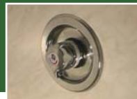
Modern fixtures & fittings