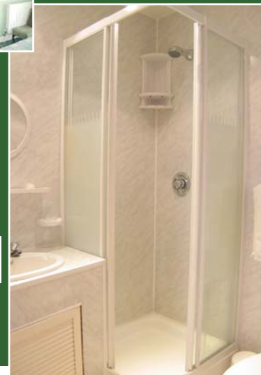
Ensuite & family rooms